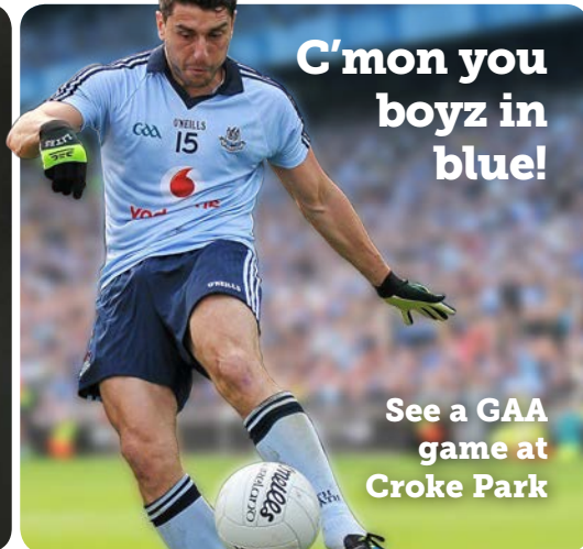
C'mon you boyz in blue!