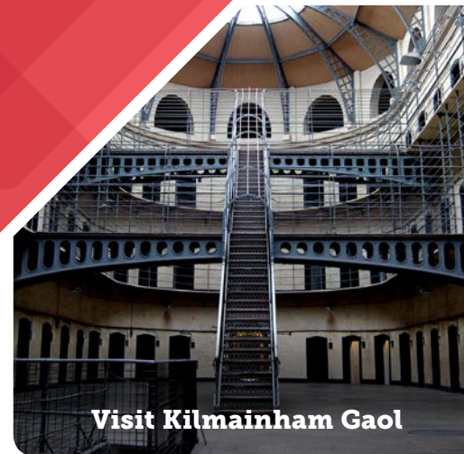
Visit Kilmainham Gaol