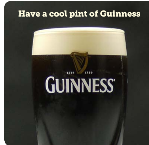
Have a cool pint of Guinness