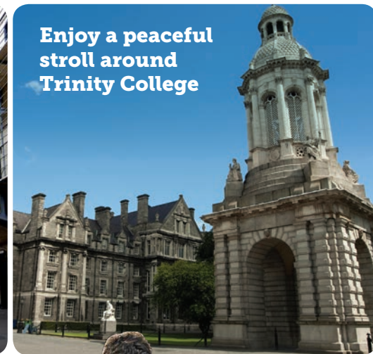
Enjoy a peaceful stroll around Trinity College