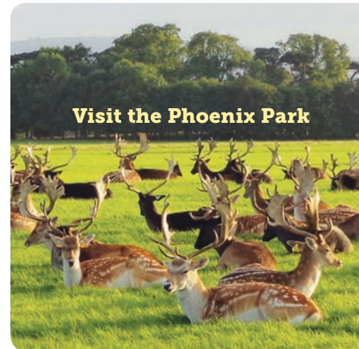
Visit the Phoenix Park