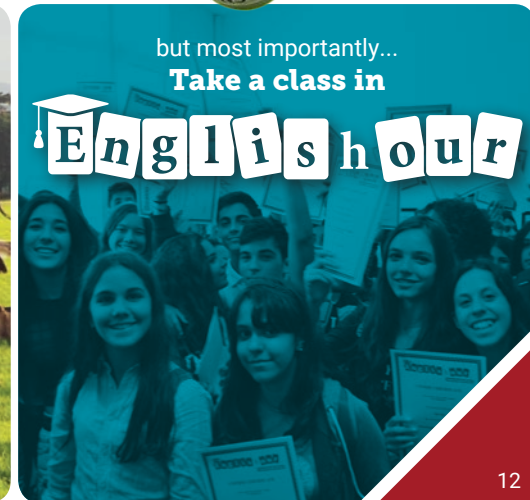
but most importantly...